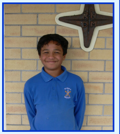
Kingston Ryder Gwynne Cup Rugby