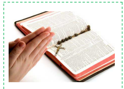
A Morning Prayer

God, please enlighten my mind with truth; Inflame my heart with love; Inspire my will with courage; Enrich my life with service. Pardon what I have been; Sanctify what I am; And order what I shall be. Amen.